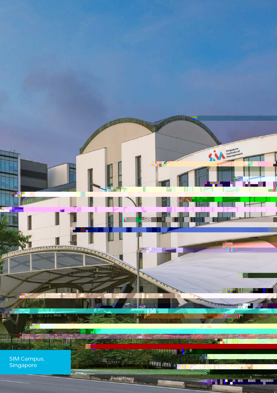
SIM Campus, Singapore